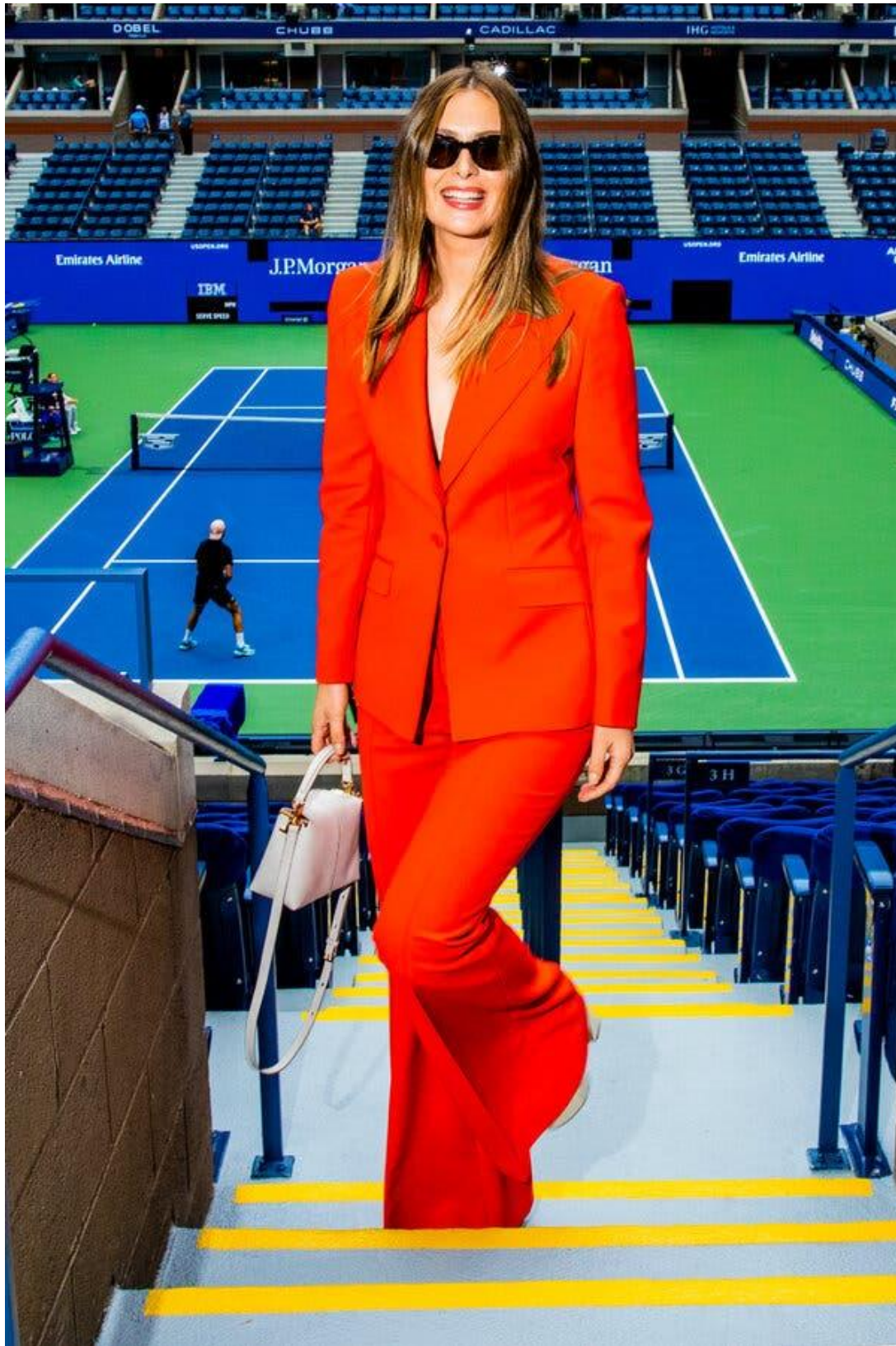
Maria Sharapova