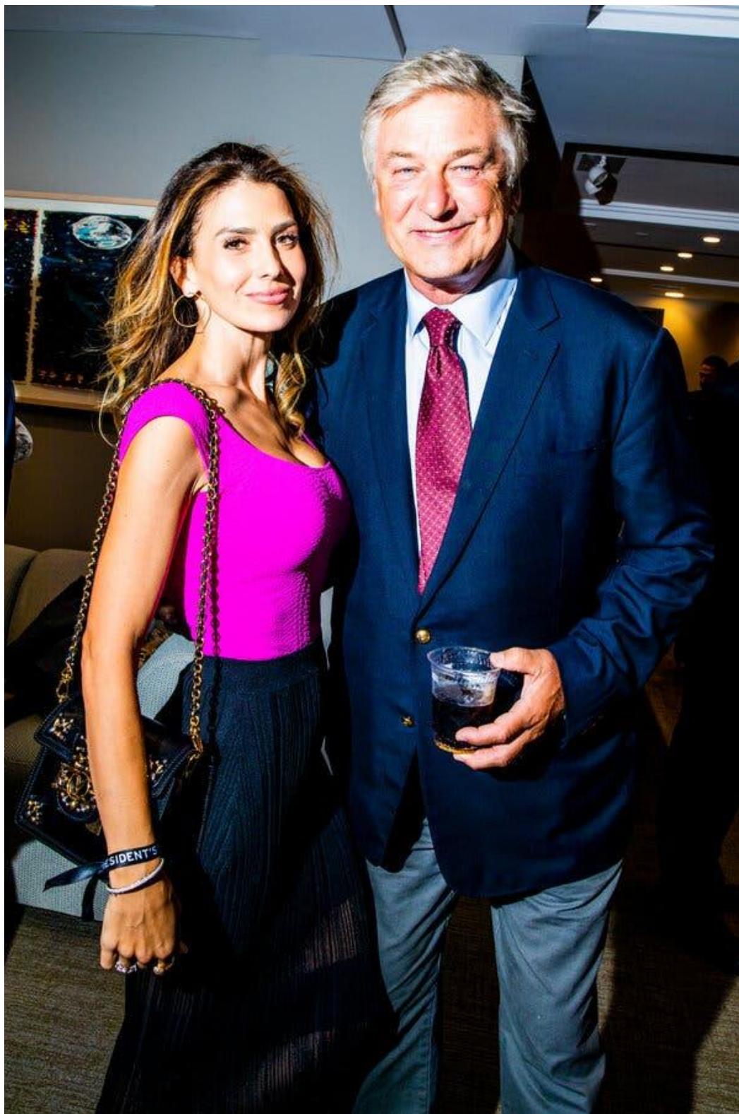
Hilaria and Alec Baldwin