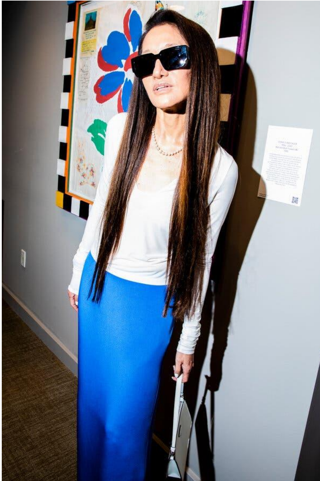
Vera Wang